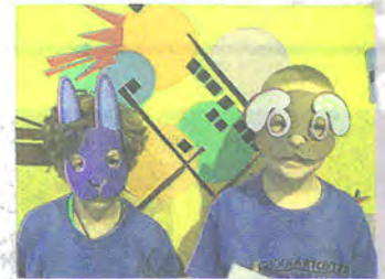
STEAM kids in masks