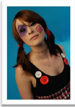
1. "Rogue Doll," by Robyn Eckersley