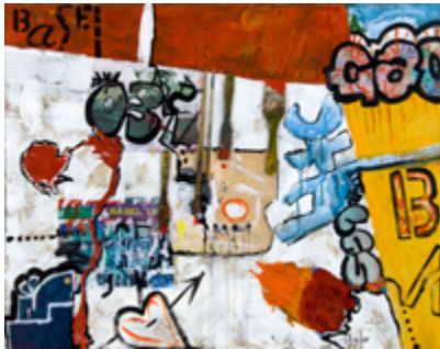
"Basel Wall," a 30" by 40" acrylic collage mixed-media piece by Judy Flescher