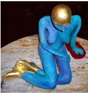
LCA-Palumbo.jpg - 3 rd Place award winner, Liu , a terra cotta sculpture by Elizabeth Palumbo, featured in the 2010 Member/Student Exhibition and Art Sale at Lighthouse Center for the Arts, April 2 through 27.