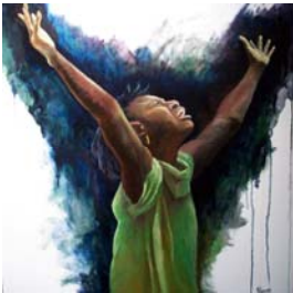
LCA-Pierre.jpg - Best of Show winner, Tears from Haiti , an oil painting on canvas by Joseph Pierre, featured in the 2010 Member/Student Exhibition and Art Sale at Lighthouse Center for the Arts, April 2 through 27.