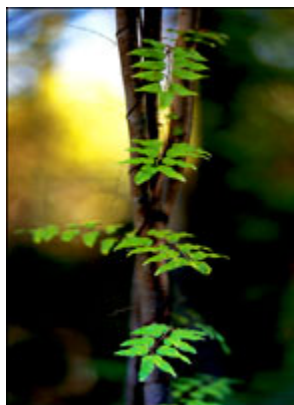
Durga Garcia Whispering Leaf Photograph