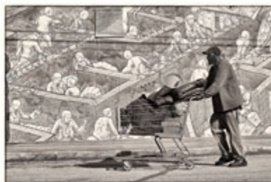
Malcolm MacKenzie Title not available Photograph Dimensions variable