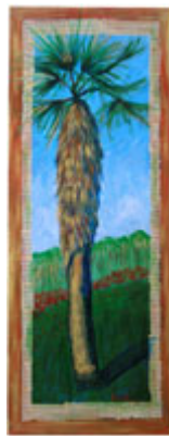
Judy Flescher Washingtonia Acrylic/Collage on Wood 30"x78"