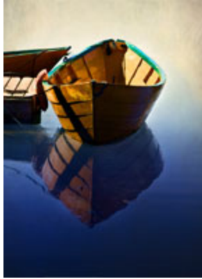
Melinda Moore Boats Photograph Dimensions variable