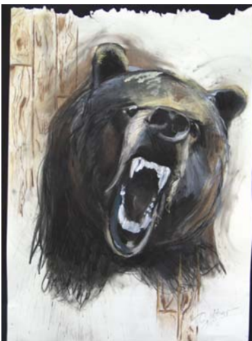
Gillespie, TD-Bear Mount. 58 x 42 p.jpg - A roaring black bear is the subject of TD Gillespie's 58" x 42" mixed-media portrait, "Bear Mount"