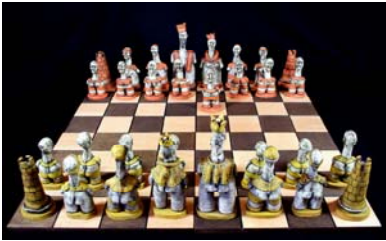
Lublinksi, Diane p- frompawntoking.jpg - A ceramic chess set, "From Pawn to King" ($6,800), by Diane Lublinksi is featured in Contempo at the Lighthouse ArtCenter. The exhibition runs from January 6 through February 10.

($1200), which is featured in the Contempo exhibition at the Lighthouse ArtCenter. The exhibition runs from January 6 through February 10.