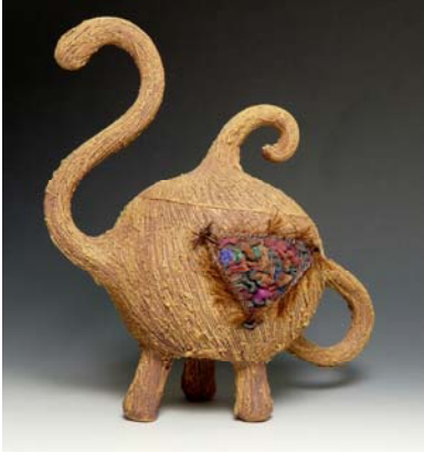
Skillings, Gina- Tea Jar p. jpg- A ceramic and stoneware sculpture, "Tea Jar" ($150), by Gina Skillings is featured in Contempo at the Lighthouse ArtCenter. The exhibition runs from January 6 through February 10.