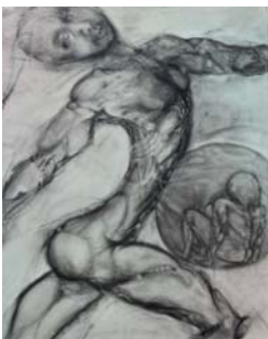
sabo, jeanette- codependence p. jpg - A charcoal and acrylic drawing, "Co-dependence" ($1,850), by Jeanette Sabo is featured in Contempo at the Lighthouse ArtCenter. The exhibition runs from January 6 through February 10.