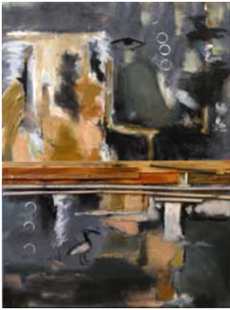
Aurre, Gerri- Inside the Sphinx p. jpg- A mixed media painting, "Inside the Sphinx" ($600), by Gerri Aurre is featured in Contempo at the Lighthouse ArtCenter. The exhibition runs from January 6 through February 10.